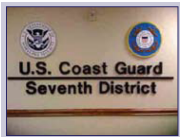
U.S. Coast Guard/Miami, Florida Interior Lobby Sign-flat cut, black anodized aluminum letters.