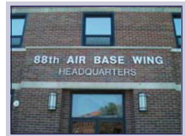
Wright-Patt Air Force Base/Dayton, Ohio-Exterior Wall Sign-cast metal letters with anodized finish.